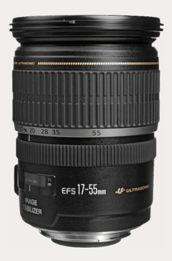
17-55mm f/2.8 Versatile wide-angle lens with flexible zooming. Improves clarity and sharpness throughout the zoom range.

85mm f/1.8 Produces a stronger blur and more control over low light environments