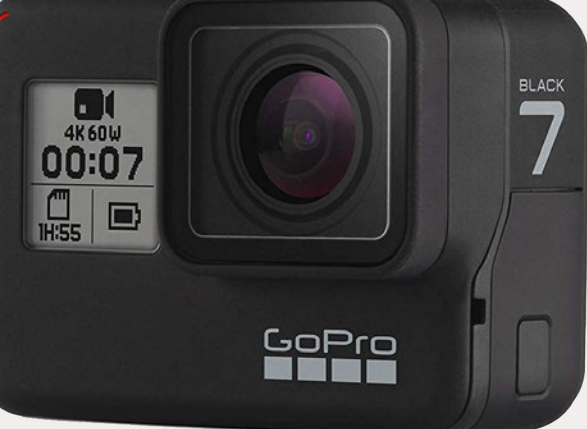
GoPro Hero 7 Kyle Wicks